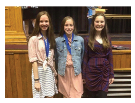
National History Day State Winners