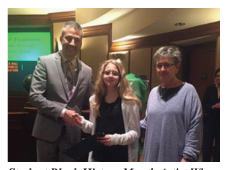
Student Black History Month Artist Winner